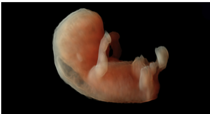
Enlarged NT at 11 weeks visualized with HDlive™ – Image courtesy of Dr. Simon Meagher

Cell-free DNA analysis screens for the common trisomies by analyzing fragments of fetal DNA in maternal blood as early as 10 weeks of pregnancy. Results do not require data from ultrasound other than gestational age, and performance varies by technology. The landmark NEXT study compared the performance of the Harmony test and FTS for Down syndrome. 38 of 38 cases of Down syndrome were detected by the Harmony test, with a false positive rate of less than 0.1%. 1